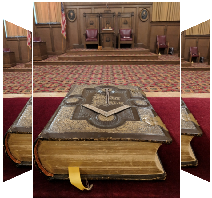
Sacramento Masonic Temple