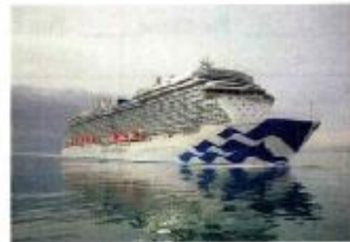
Aboard the beautiful Discovery Princess

Prices shown are per person, double occupancy. Additional costs include $161 per person taxes and port fees. Air fare, transfers, tours, and gratuities are not included. Fares may be upgraded to Princess Plus or Princess Premier for an additional charge. Travel insurance is an additional cost and is highly recommended.