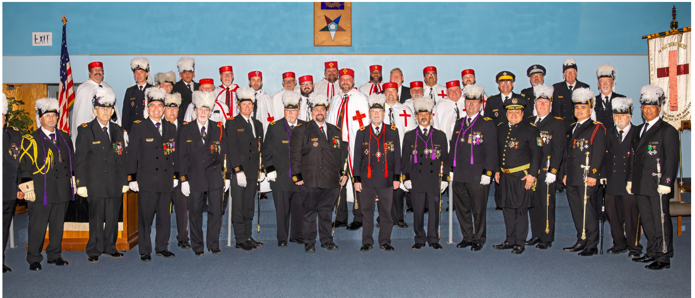
Beauseant Commandery # 81 Escondido, Ca.