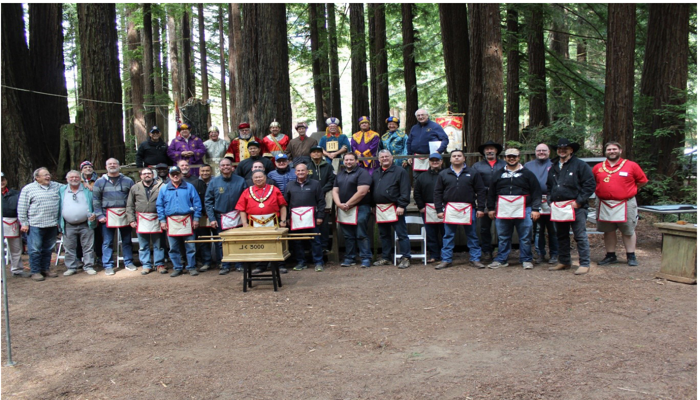
Royal Arch Class and Cast