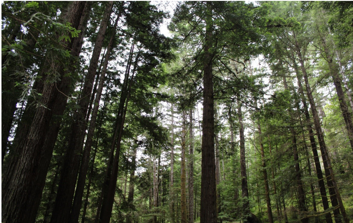
The Canopy above The Lodge