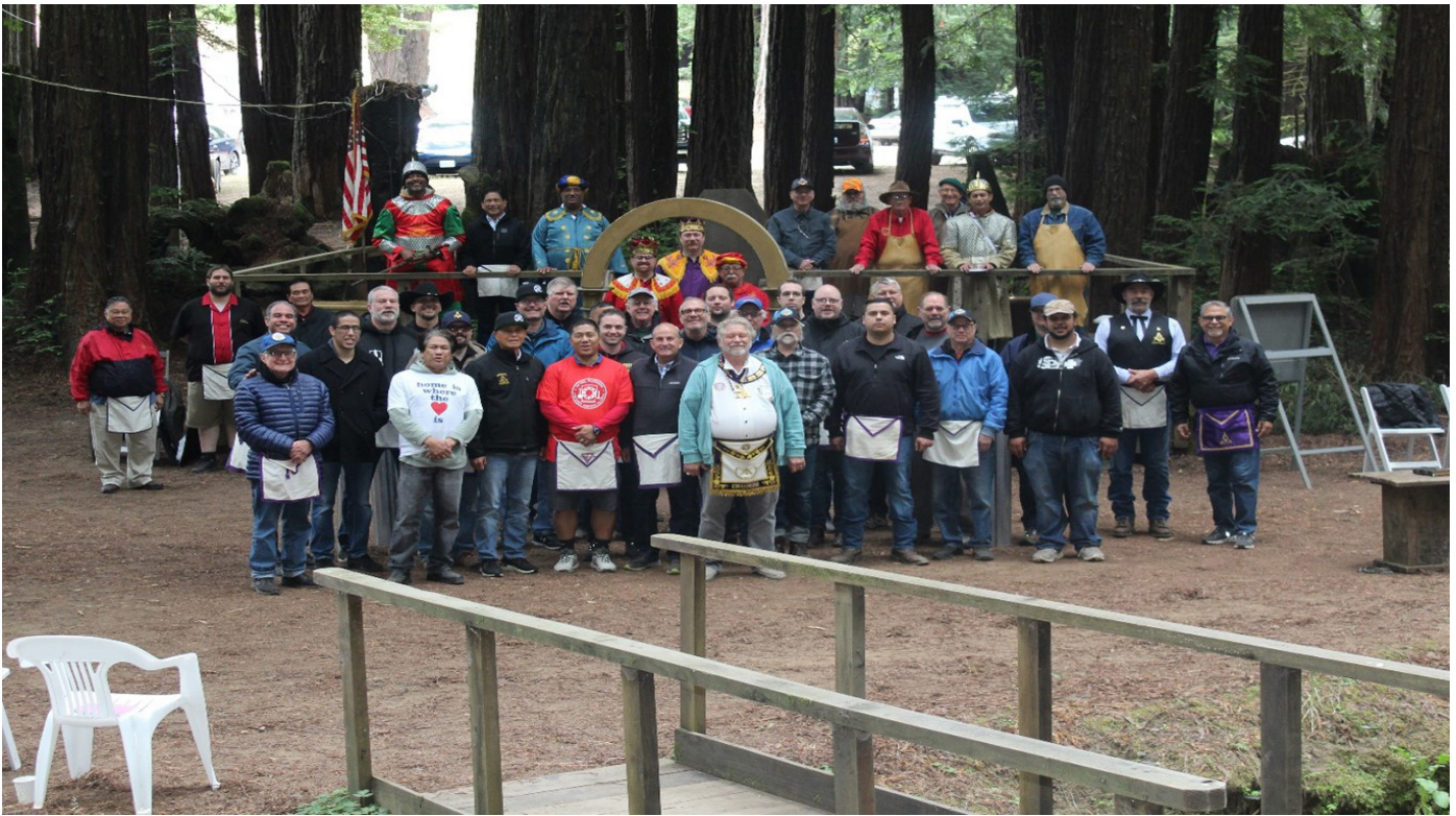
Select Master and Cast