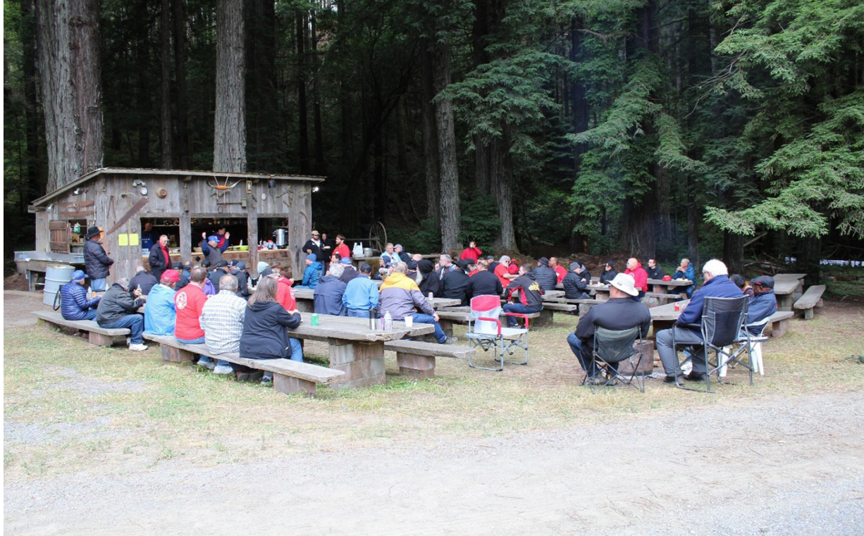
Cook Shack and Dining Area