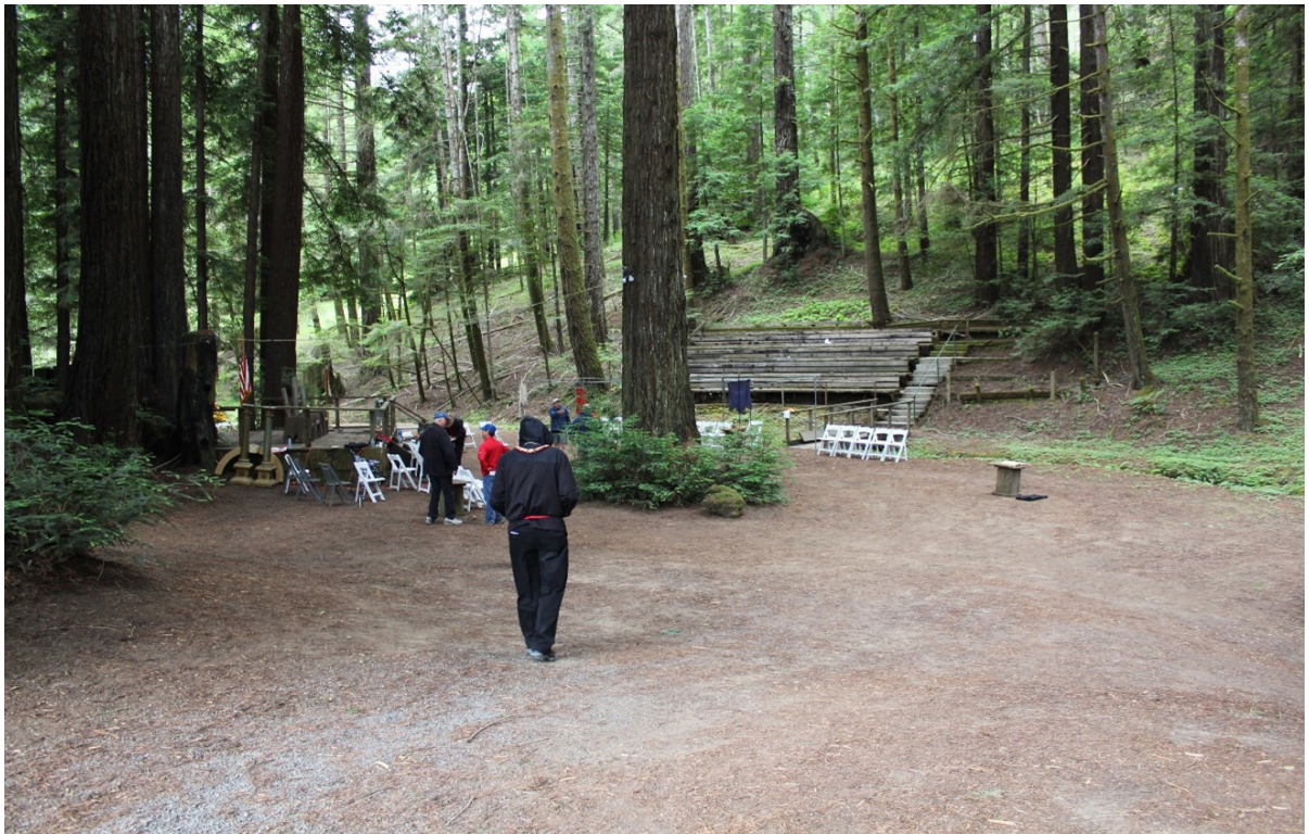
The lodge with seating for sideliners