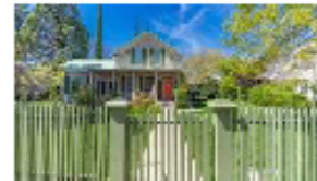
Sutter Creek Inn