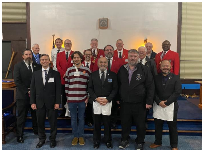
Mark and Past Master Degree Candidates and Cast

The Sacramento Sierra York Association assembled for the conferral of the Mark Master and Past Master Degrees on March 22 nd in Yuba City. Thank you Washington Chapter No. 13 for hosting the evening and the cast for the Mark Master and four candidates. Nevada Chapter #6 conferred the Past Master Degree for five candidates. Most of the cast members were busy putting everything away when the photo was taken.