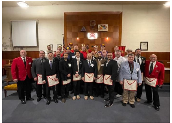
Most Excellent Master and Royal Arch Degree Candidates and Cast

The East Bay York Rite Association will be hosting the Grand High Priest Golf Tournament later this month on April 29 at the Blue Rock Springs Golf Course in Vallejo. Proceeds from this fundraiser will go to the benefit of the DeBarrow/Wohlfarth Royal Arch Scholarship Program and Royal Arch Research Assistance. You can sign up to play in the tournament, or you or your Chapter can sponsor a hole. See the sign-up flyer included in this edition of the Workman.