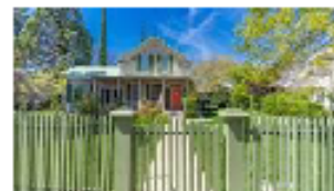
Sutter Creek Inn