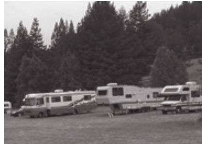
RV's and Tent Campers Welcome

Climate & Misc.: The coastal climate is either foggy and cold, or hot; Think layers. Dress attire is always casual. There's plenty to do so come a couple of days early. This is a cattle ranch so watch your step. No dogs allowed. In the town of Mendocino, 10 miles away, you can visit historical landmarks, go salmon fishing, or just enjoy the scenic coastline. Ft. Bragg, 8 miles north of Mendocino, is also historical and a great place to visit.