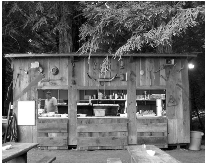
Comptche Cook Shack

Accommodations: You could make a vacation around this event. Self-contained RVs and tent campers are welcome to set up from 6/20 - 6/24. Campfires only in designated areas. There are no 120v hookups. There is a chemical blue room in the meadow. Restrooms at the degree site have hot water and a shower in the men's is available to women. Motels are available at the coast, 30 minutes on a dark and winding road from the RAM site. Call as soon as possible for your reservations, it's a popular tourist area.