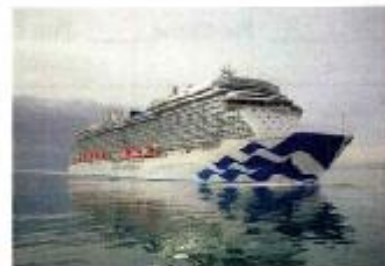
Aboard the beautiful Discovery Princess