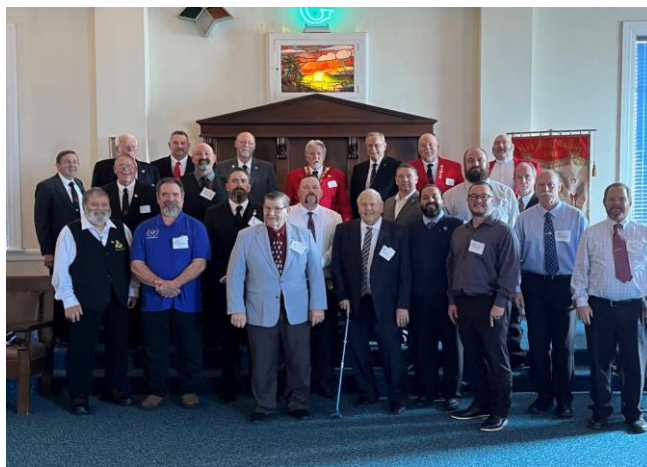
Mark Master and Past Master Degree Cast and Candidates, Orland Laurel Lodge No. 245, F&AM

several ways to support and strengthen our craft. First you'll notice the number of Chapters that assembled for this occasion, supporting one another, and making new Royal Arch Masons. This is the second year in a row that these Chapters have arranged to confer Royal Arch Degrees in lodges where we normally don't meet as York Rite Masons.